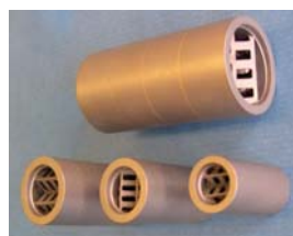
Mixing elements brazed into a rod (brazed with a nickel braze in a vacuum oven)