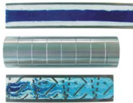
Mixing of epoxy resin/hardener in an empty pipe and in a static mixer