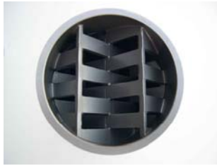
Mixing Element LMXR (Licensee of BAYER AG)