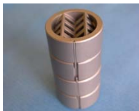
Standard design with 4 (four) single elements (the most cost effective solution)

Static mixers for blow molding are available in standard designs. They are also available in special designs made on request of our clients.